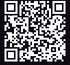
RUT200 360° VIEW